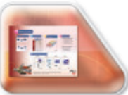
Table of Content

*Additional configurations available on request. Male & female connector color must match for proper keying